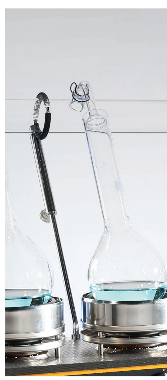
Issue 09/2015 | Subject to technical amendments